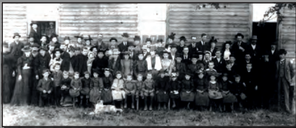
Church Congregation around 1895

The history of the church and its cemetery is replete with the names of men and women who pioneered the settlement of Kings Creek near the border between North Carolina and South Carolina prior to the American Revolution. These pioneers were predominately German and Scots-Irish, a hardy and independent people who traveled to this area by the "Great Wagon Road".