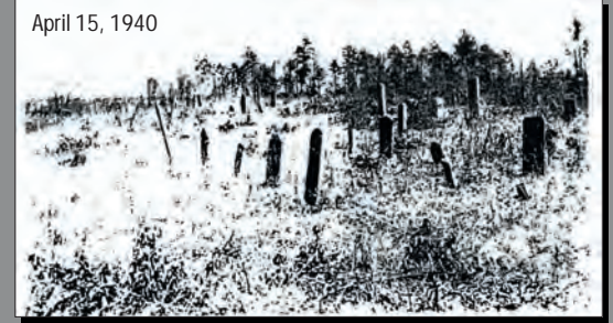
April 15, 1940

Historic Shelby Foundation has established a Shiloh Cemetery Preservation Fund. Your contributions are tax deductible, and will be used exclusively for the preservation, conservation, restoration, and repair of the "Old Shiloh Burying Ground". Please take part today, and contribute to save Shiloh for future generations.